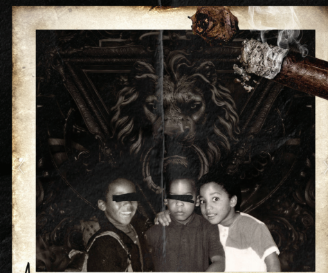
A.D. Millz P.O.A.M ft. Ferocious Presence of a man Produced By Big Zeke The Politician

P.O.A.M (Presence of a Man) feat. Ferocious